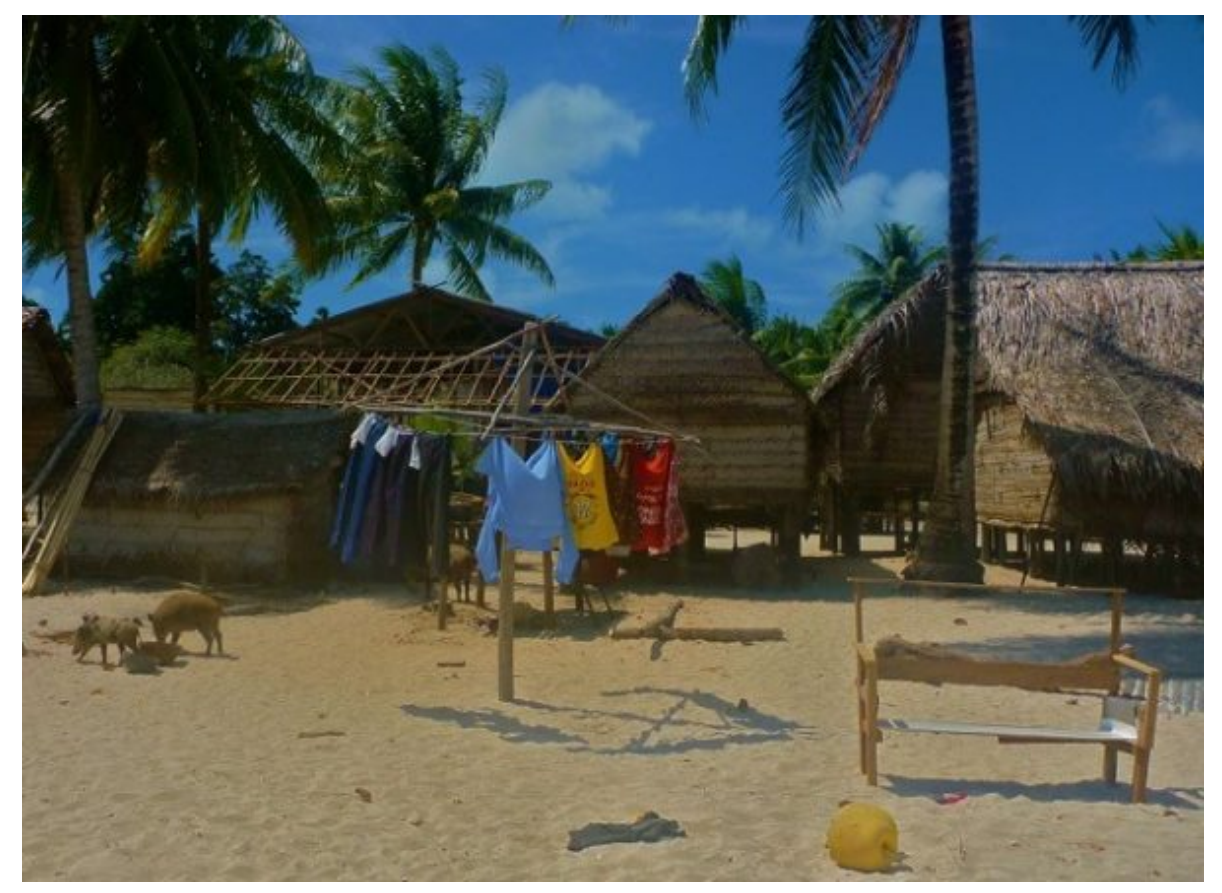
A Hills Hoist copy at Boagis village, Muyuw (Woodlark) Island

But there was a worrying side that we shared. We visited many remote islands where basic services are deplorable, particularly their health services. At one subprovincial health centre in Guasopa village [Woodlark Island], they had nothing but Panadol. We shared our first aid resources and knowledge, and treated those we could with spare drugs we had brought from Australia. There are so many issues facing PNG that we despaired at its future prospects.