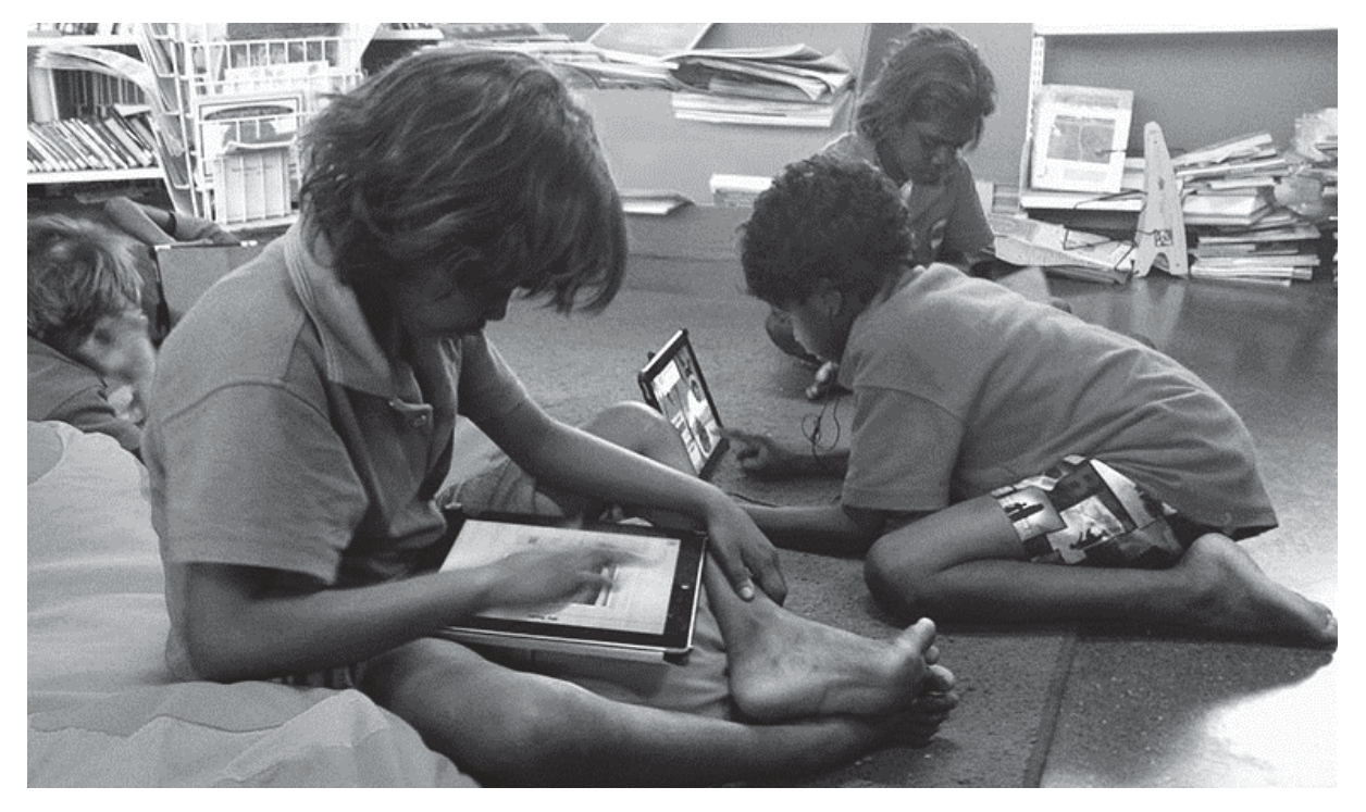
Access to reliable high speed broadband and online resources enriches the classroom experience for students in remote schools.