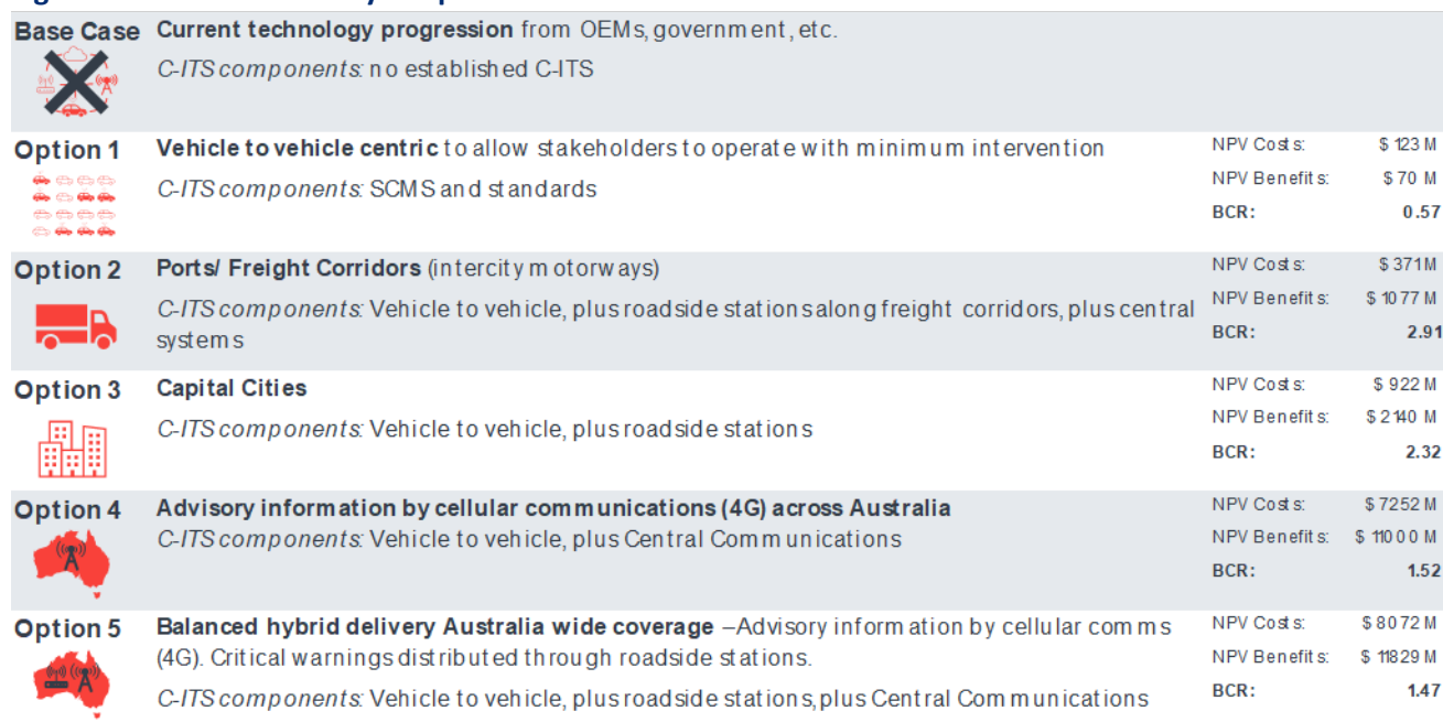
Figure 2: Cost-benefit analysis options and results

Beyond the figures generated, the modelled scenarios also provide evidence that C-ITS services do not need to be installed everywhere from the start. Option 2, which was limited to supporting services between ports and freight hubs in city areas, suggests that there are relatively low cost, no-regrets opportunities to create a minimum viable C-ITS market in Australia. To achieve this, governments would need to provide a base layer of support for C-ITS, like central services to distribute road data for a viable C-ITS. This then gives governments the capacity to prioritise the geographic spread of infrastructure, and to decide what suite of use cases should be supported in what areas, depending on policy priorities.