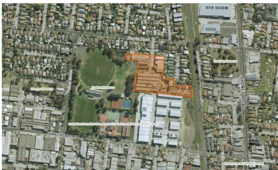
Sheppard Street and Norris Street, development site (in orange) North Coburg, Victoria. The land to which the Incorporated Plan applies.