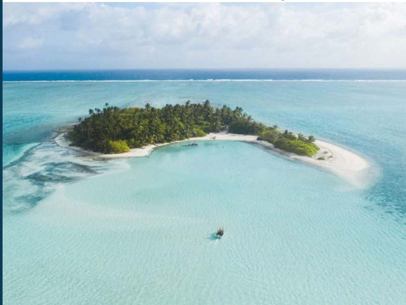
Pulu Blan Madar’s crystal-clear waters are mesmerising.

Update on the Cocos (Keeling) Islands Coastal Hazards Risk Management and