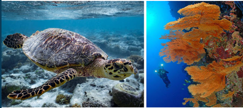
Image left: Hawksbill turtle. Image right: Coral reef.

Parks Australia is seeking comments on draft management plans for the Christmas Island and Cocos Keeling Islands Marine Parks, and I encourage all of you to read, review and offer your thoughts.