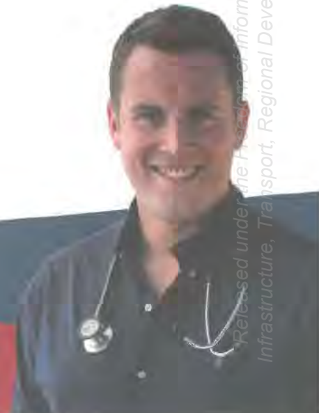
Dr Gordon Reid MP Federal Member for Robertson