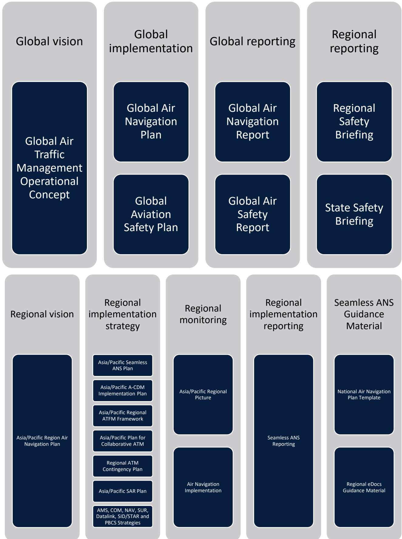
Figure 1: Structure of global and regional planning and reporting on the ANS