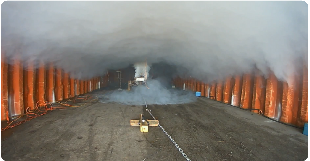
An example of a thermal runaway event with a 1.4kWh lithium-ion battery, 40% state of charge. Large amounts of toxic, flammable vapour fill the confined space. Ref: Christensen, 2023.