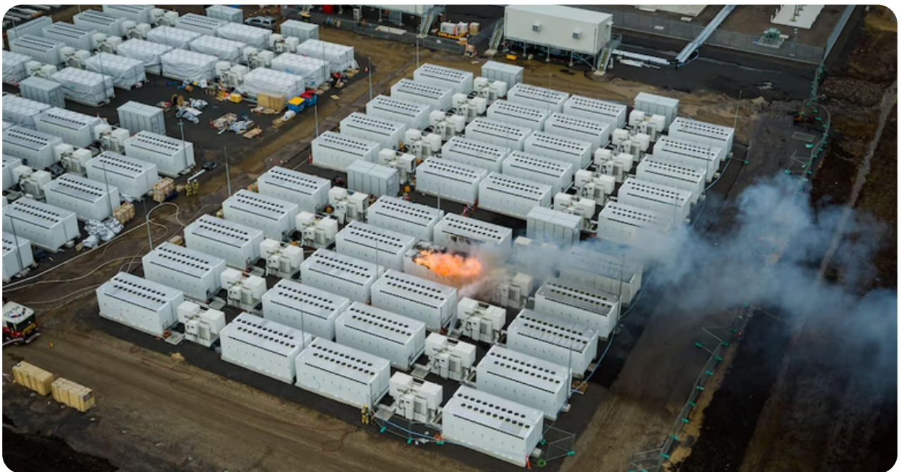
A fire in one of the Tesla Megapacks at the Victorian Big Battery during construction. The incident required a significant emergency response and burnt for over 3 days. Ref: Wong. L. 2021