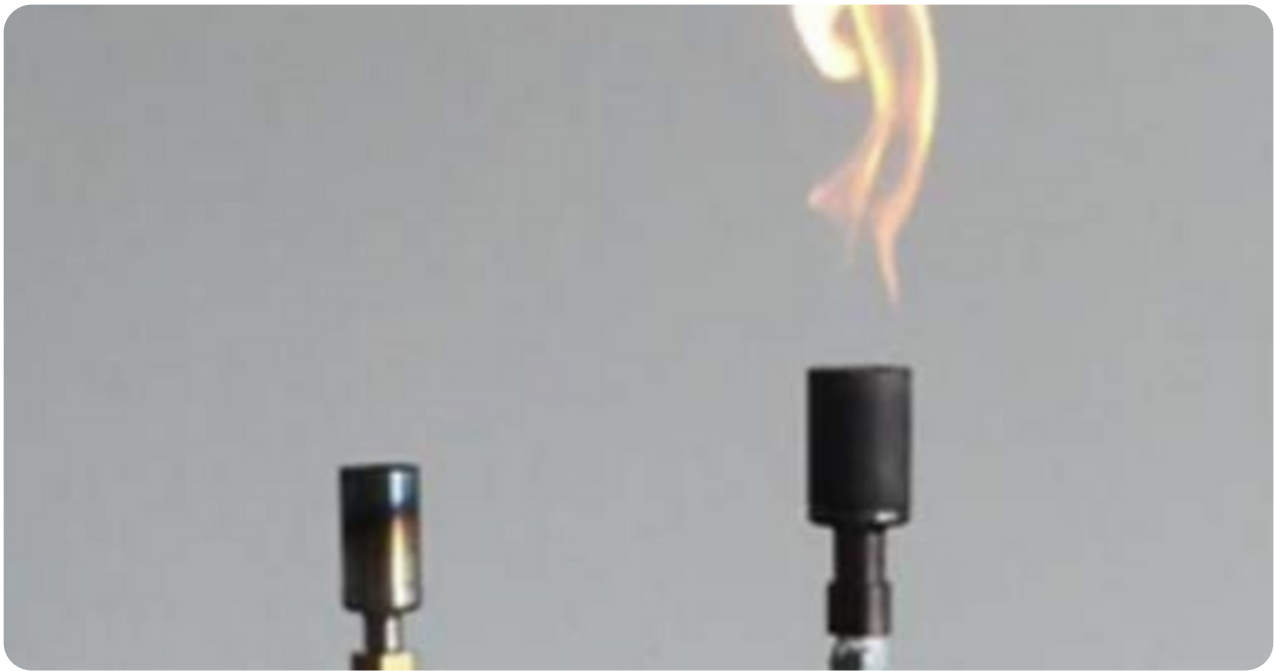
Hydrogen (left) burns with a invisible, more intense flame when compared to butane or propane gas (right).