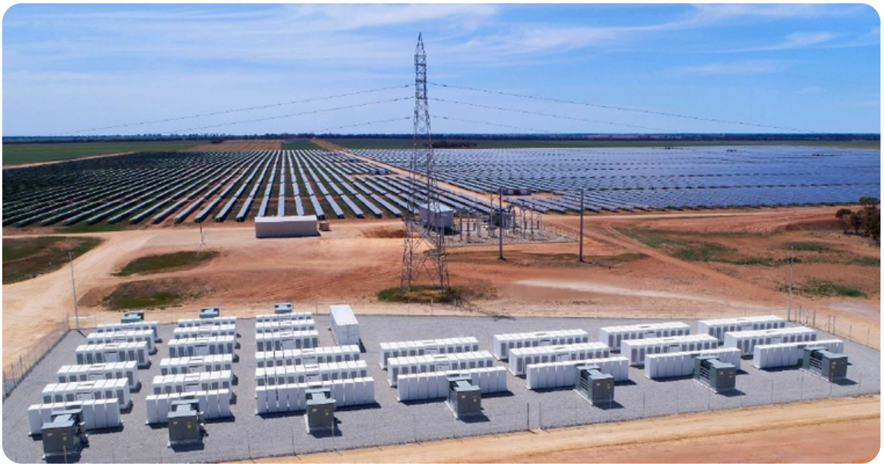
The Gannawarra energy project combines a 25MW / 50MWh BESS with a 50MW solar installation. The AAA is advocating for airports to adopt such installations. Ref: Edify, 2021.