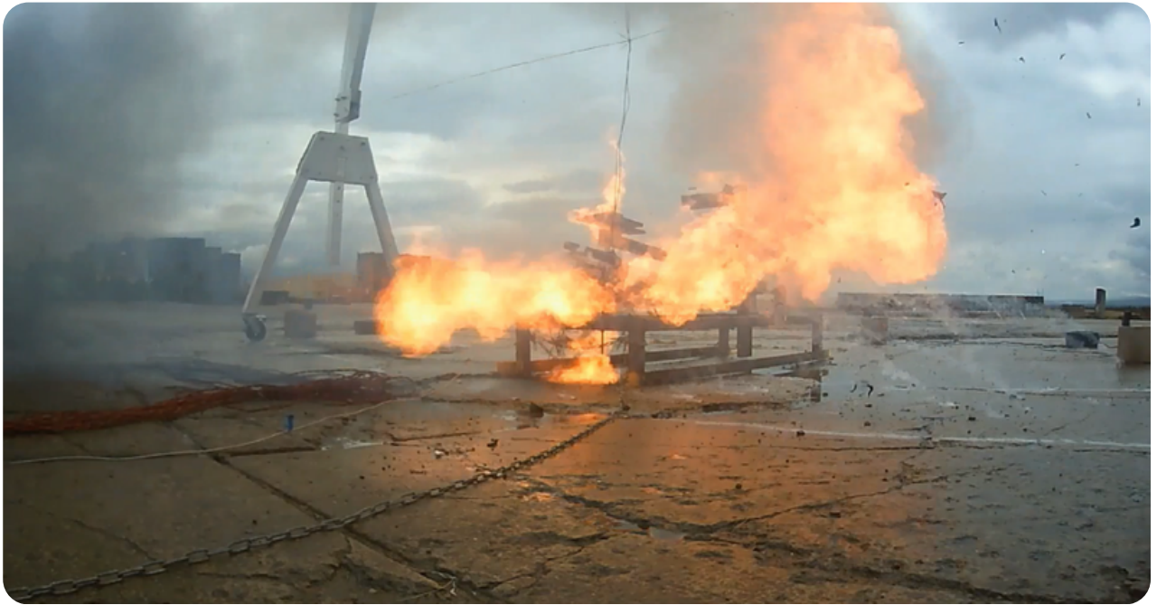
An example of a thermal runaway event with a 1.4kWh lithium-ion battery, 100% state of charge. Flames are 4 metres in length, reaching 1000 degrees celsius. Ref: Christensen, 2023.