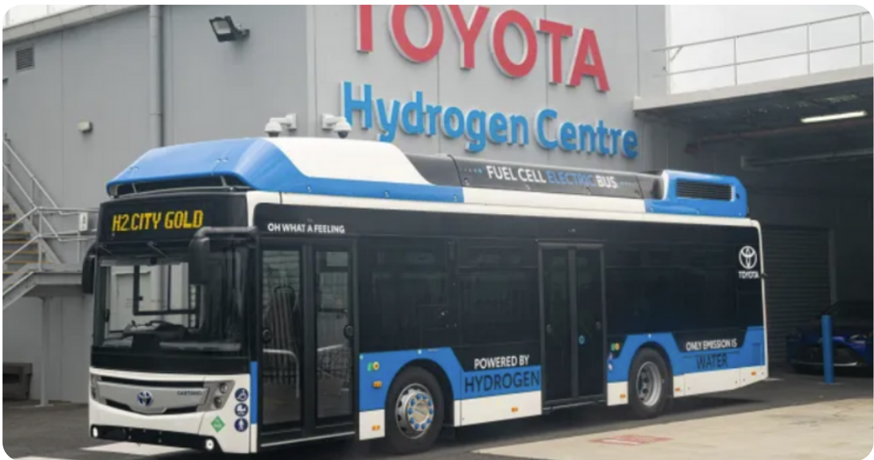
The H2 City Gold bus, built in collaboration by Toyota and CaetanoBus. This vehicles carries 37kg of Hydrogen gas and a lithium-ion battery pack, ranging from 44 - 80kWh. Ref: Thomson, 2022