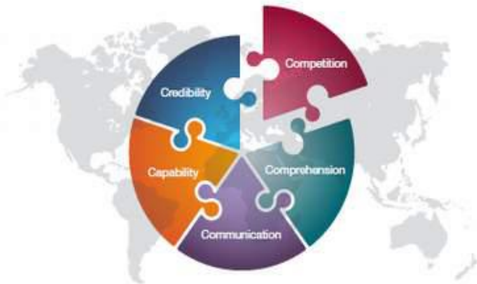
Figure 3 – Competition – the fifth ‘C’ of deterrence

The character of the strategic context requires a strategic response that integrates all of the instruments of statecraft: defence, diplomacy, development, intelligence and security, and trade policy. A credible capability to deter war remains central to our military purpose. In an era of strategic competition our deterrent posture needs to be more actively managed and modulated, necessitating the introduction of a fifth ‘C’ – that of competition – to the traditional deterrence model of comprehension, credibility, capability and communication. This recognises the need for more active deterrence: which includes a more competitive posture and way of operating to better compete below the threshold of war in order to deter war, and to prevent our adversaries from achieving their objectives in fait accompli strategies.