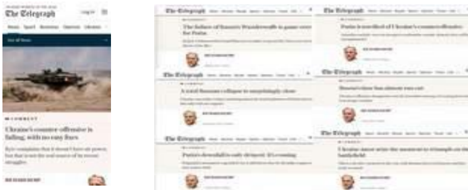
Image 1. Richard Kemp: Government aligned content by coincidence or by inducement?

Obviously the UK and US Governments have vastly more resources to spread and amplify their content or propaganda, but it's important to remember that the information space of the Australian public likely encounters significant amounts of Government influenced content via US and UK sources.