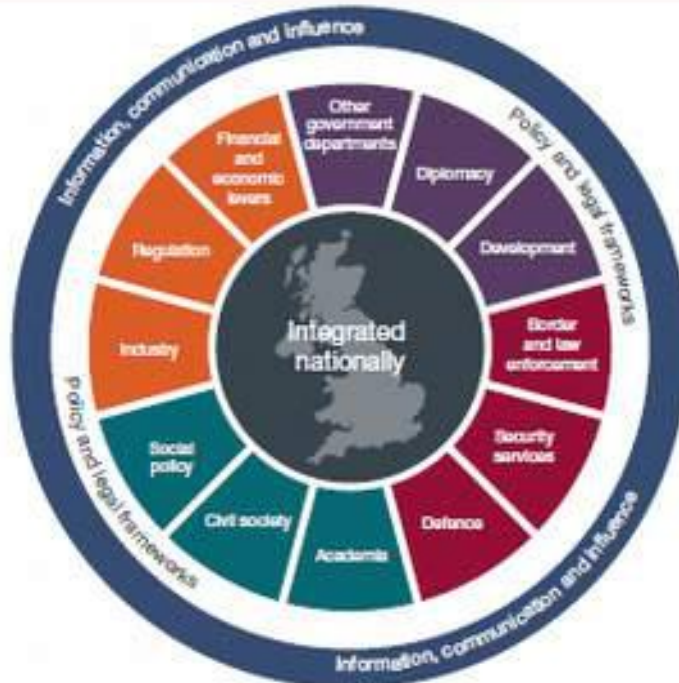
Figure 2 – The military instrument must be integrated within a total national enterprise