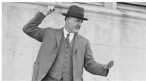
NSW premier Jack Lang circa 1930.

NSW Premier Jack Lang was the only politician to ignore Niemeyer and place his citizens interests above the interests of the Bank of England. Lang refused to pay interest on the war loans, sending the principal amount only. The federal government caved in to pressure and paid the NSW interest amount. In the political deadlock that followed, a shadowy fascist street gang emerged called the new guard and with threats of violence and civil disobedience greatly assisted the interests of the Bank of England by creating an air of lawlessness and chaos in Sydney which in turn gave cover and justification for the NSW Governor to terminate Premier Lang's royal commission to lead the NSW Government.