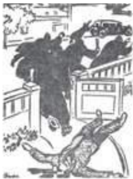
The New Guard's Fascist Legion as depicted in the 'Labor Daily' newspaper, May 1932

The big fella 1.93 metre Premier Jack Lang and NSW Governor Sir Phillip Game who removed him.