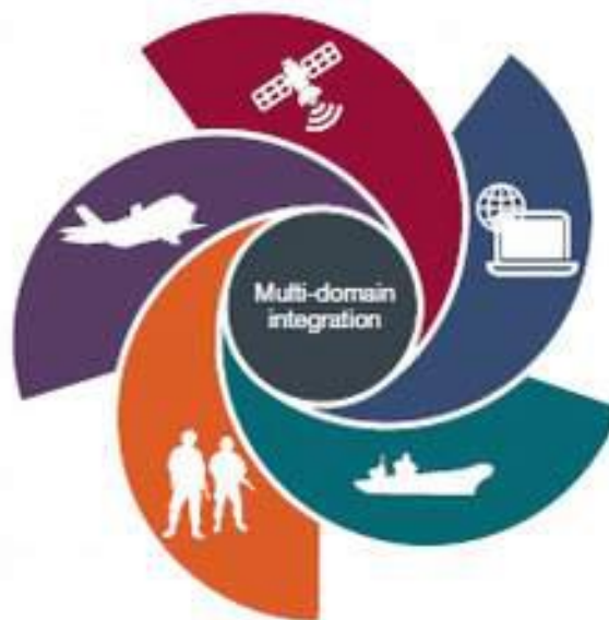
Figure 1 – Multi-domain integration goes beyond ‘joint’ and adds up to far more than the sum of the parts