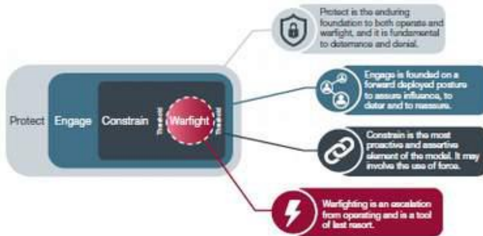
Figure 4 – The Integrated Operating Framework

Operating includes the complementary functions of protect, engage and constrain.