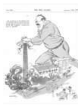
Jack Lang as seen by the New Guard's magazine, The New Guard, Jan 1932.

Premier Jack Lang was sacked, despite being legally elected and hugely popular. By the time of the new election, the NSW public had been subjected to months of misinfo/disinfo and smear campaigns aimed at Lang and published relentlessly in the daily press. By election time the volume of lies aimed at Lang did their job and he was defeated.