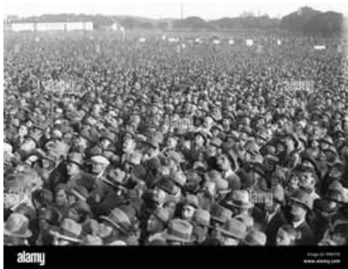
Huge crowds came to hear Jack Lang in Sydney's Moore Park