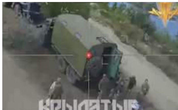
Ukraine: Destroyed NATO vehicles and video from a kamikaze drone before impact

The US, UK, NATO and allies have no actual realistic capacity to wage modern war because they lack the capacity to provide the required volume of munitions to sustain one. In order to change this situation it will cost many hundreds of billions of dollars and up to a decade to do so.