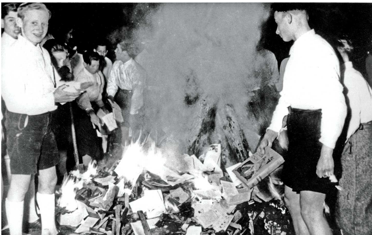
Combatting Misinformation and Disinformation c.1938

Why limit ACMA's ability to censor opinions published on-line only ?