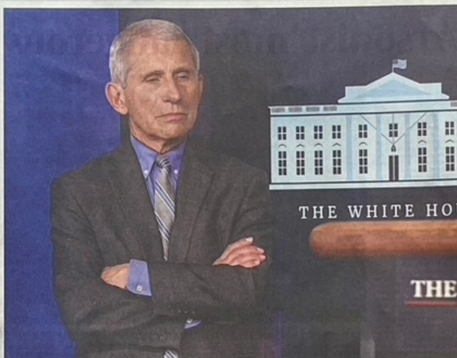
Dr Anthony Fauci, former chief medical advisor to the US president and White House Covid-19 spokesman