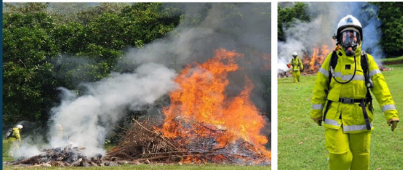
VFES Live Fire Breathing Apparatus Training at the CI Golf Course.

The Christmas Island Volunteers held an awards evening to celebrate the long service achievement of