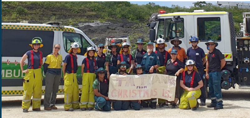
Joint VFES and St Johns Ambulance Crash Rescue Exercise Christmas Island.