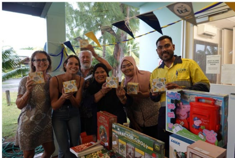
Door Prize Winners

Thank you to Christmas Island Post Office for their generous donation of items for our Monster Raffle. Congratulations to our 13 winners!