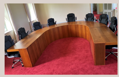
Please remember to enrol if you want to vote!

The inaugural meeting is planned for 18<sup>th</sup> October and the Assembly chamber furniture has been reinstalled in the Old Military Barracks along with workspaces for the members.