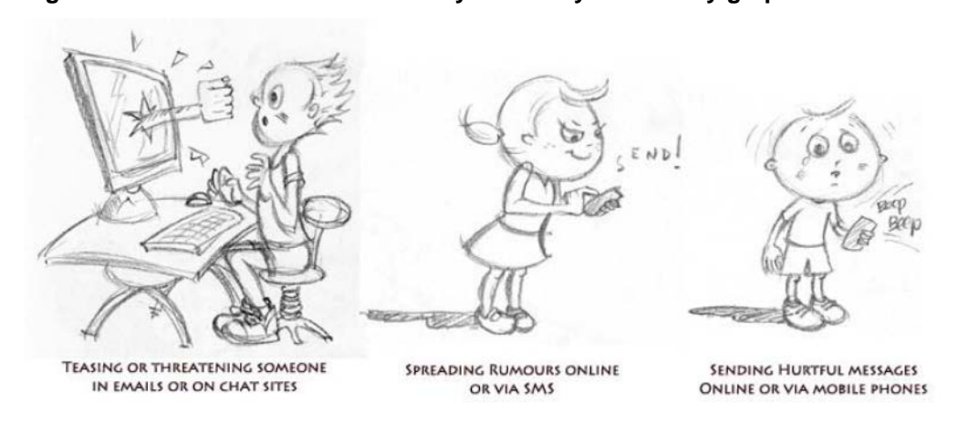
Figure 1 Joint Select Committee on Cyber-Safety 2011 study graphic definitions

In the survey for children aged 13 years and older, cyberbullying was not defined, rather, a series of questions were posed relating to behaviours (pp 551–552):